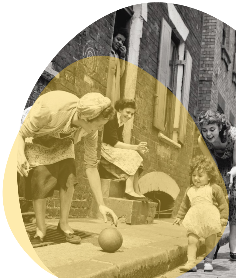
Image of Family and Kinship in East London book cover. Credit: Penguin Books Ltd

Family and Kinship (1957) sought to digest what was happening in Britain's cities in the aftermath of the Blitz – to which central and local government were responding with a feat of unprecedented urban reconstruction (Bullock, 2002; Saumarez Smith, 2019). Aside from damage from bombing raids, much of the nation's surviving housing stock was ageing and unfit for sanitary habitation. Slum clearance was the order of the day, displacing millions of people to be rehoused in newly constructed estates, suburbs, and New Towns (Yelling, 2000), ushering in a new age of domestic modernity. The Institute, however, threw the meliorism of this housing drive into doubt. Family and Kinship (1957) contended that the squalor-ridden conditions in the slums of Bethnal Green had contributed towards the shaping of a uniquely communitarian and neighbourly way of life for its working-class residents. The slums were home to complex and deep-rooted 'extended family' networks, built upon matrilineal connections of interdependence and mutual support. This model of kinship, the book warned, was in danger of extinction in the face of slum clearance and dispersal to newly built neighbourhoods where people felt more atomised and isolated (Young and Willmott, 1957: xxviii-xxix).