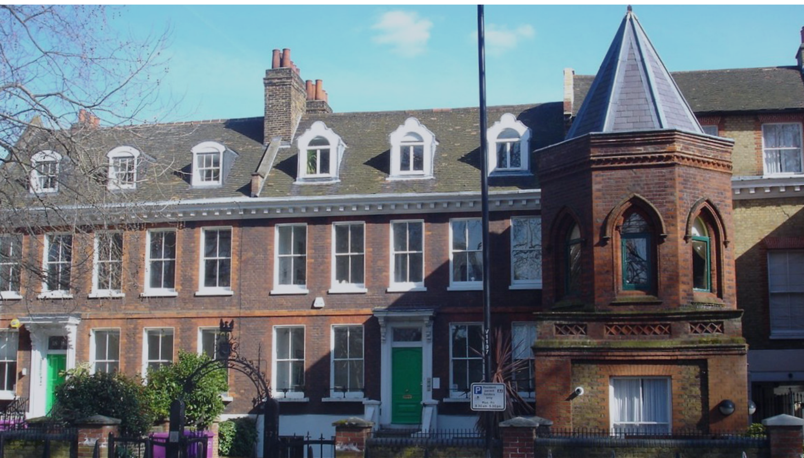
Image of Victoria Park Square, where the Institute, and later The Young Foundation, were based.